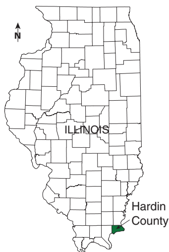
Figure 1 Project location map.

This report accompanies a 1:48,000 scale map of Hardin County, Illinois. Hardin County is situated in southeastern Illinois, bordered on the west by Pope County, on the north by Saline and Gallatin Counties, and on the south and east by the Ohio River (Fig. 1). Fieldwork was conducted in 2013 and 2014. Outcrops were common along steep slopes but were concealed by soil cover in the sinkhole plain in the southeastern portion of the map area. Faults were rarely exposed and often inferred by interpolating the locations of fluorite mines. The oldest rocks of Devonian age are exposed at Hicks Dome, in the northwestern part of the county. Mississippian rocks crop out in an oval-shaped belt around the central uplift. Pennsylvanian rocks occur in the northern and eastern parts of the county, as well as in the Rock Creek Graben. Permian igneous intrusions occur as dikes or narrow sub-vertical “pipe-like” intrusions and in thin layered sills. These rocks are ultramafic lamprophyres, autolithic breccias, and diatremes and are present throughout Hardin County. The igneous rocks trend north-northwest and are also clustered around the periphery of Hicks Dome.